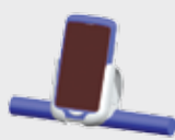
▪ 91ACC0047 Trolley Holder (60 pcs)